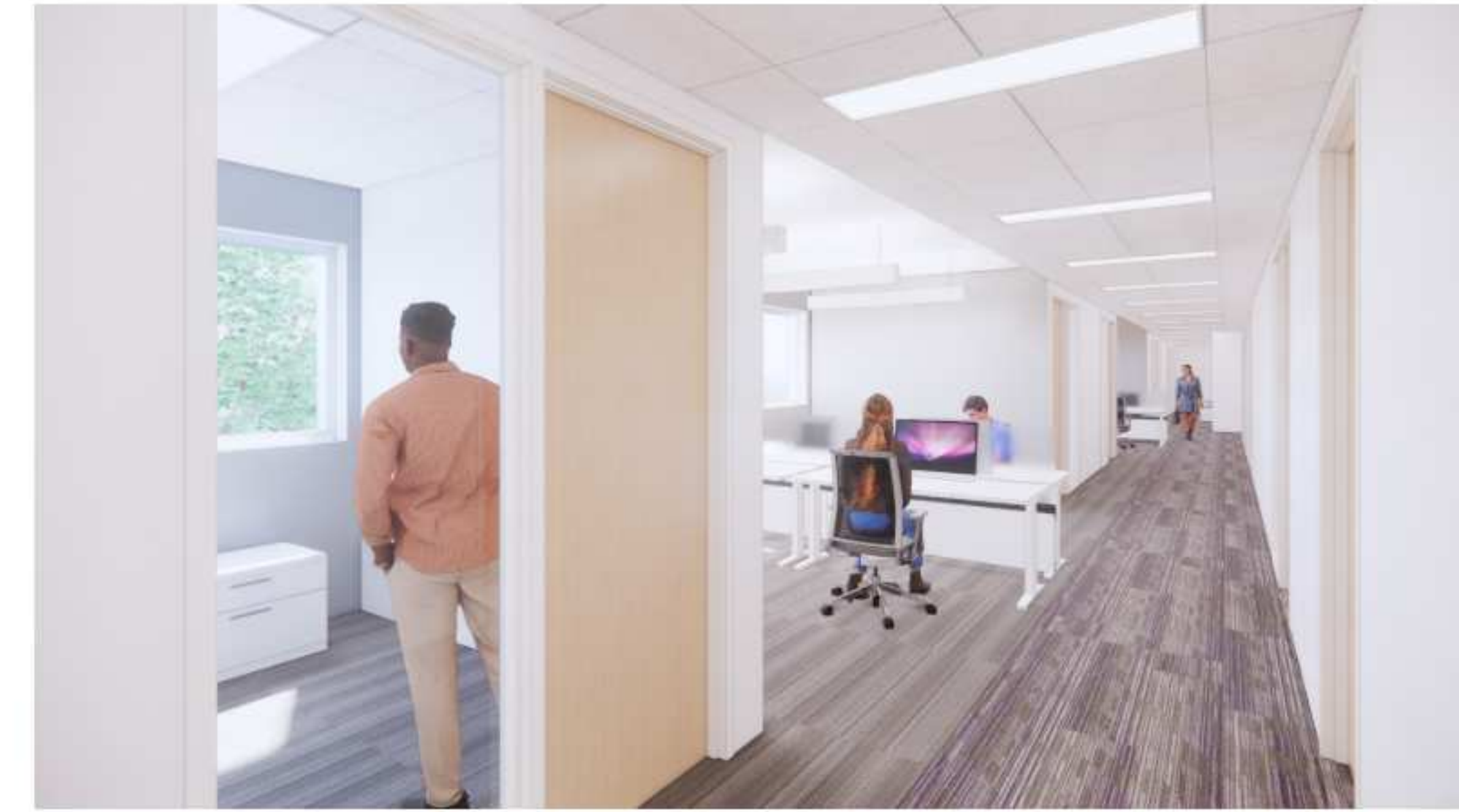
SECOND FLOOR OFFICE