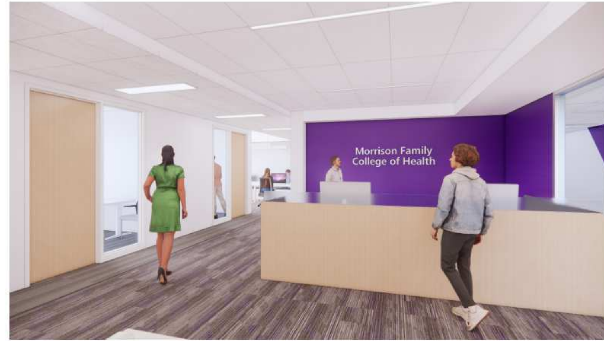
SECOND FLOOR RECEPTION