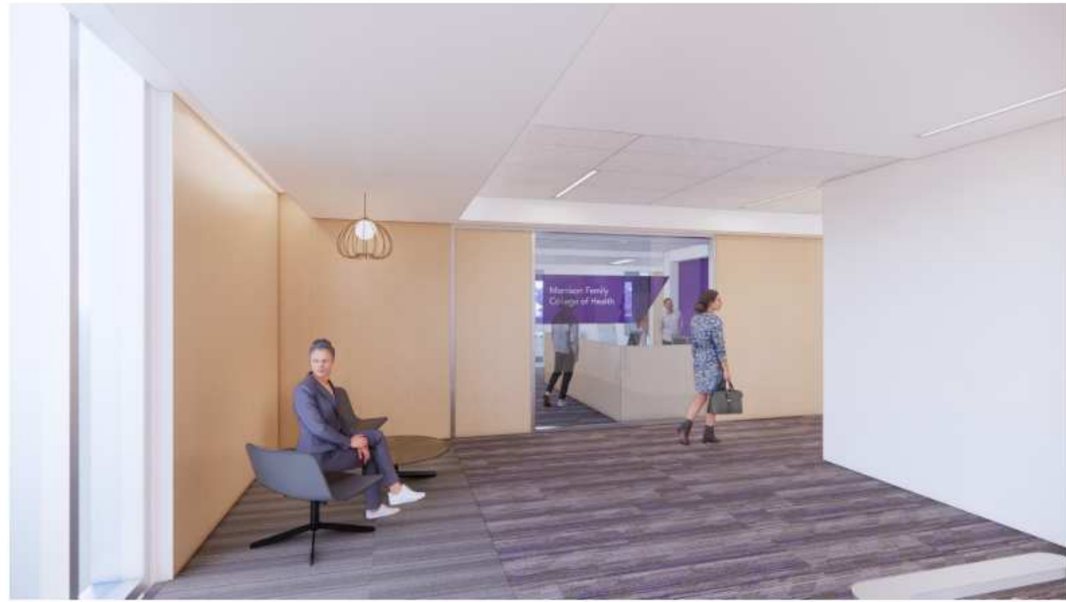
SECOND FLOOR LOBBY STAIR