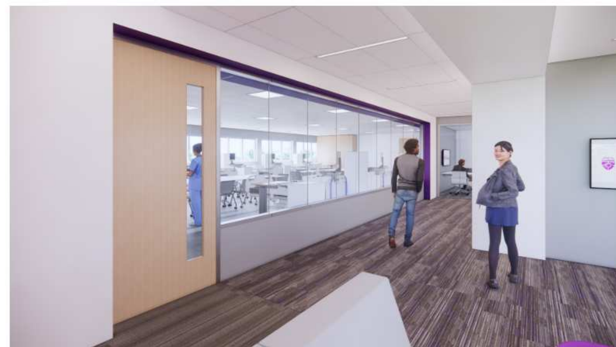
THIRD FLOOR CIRCULATION OUTSIDE SKILLS LAB