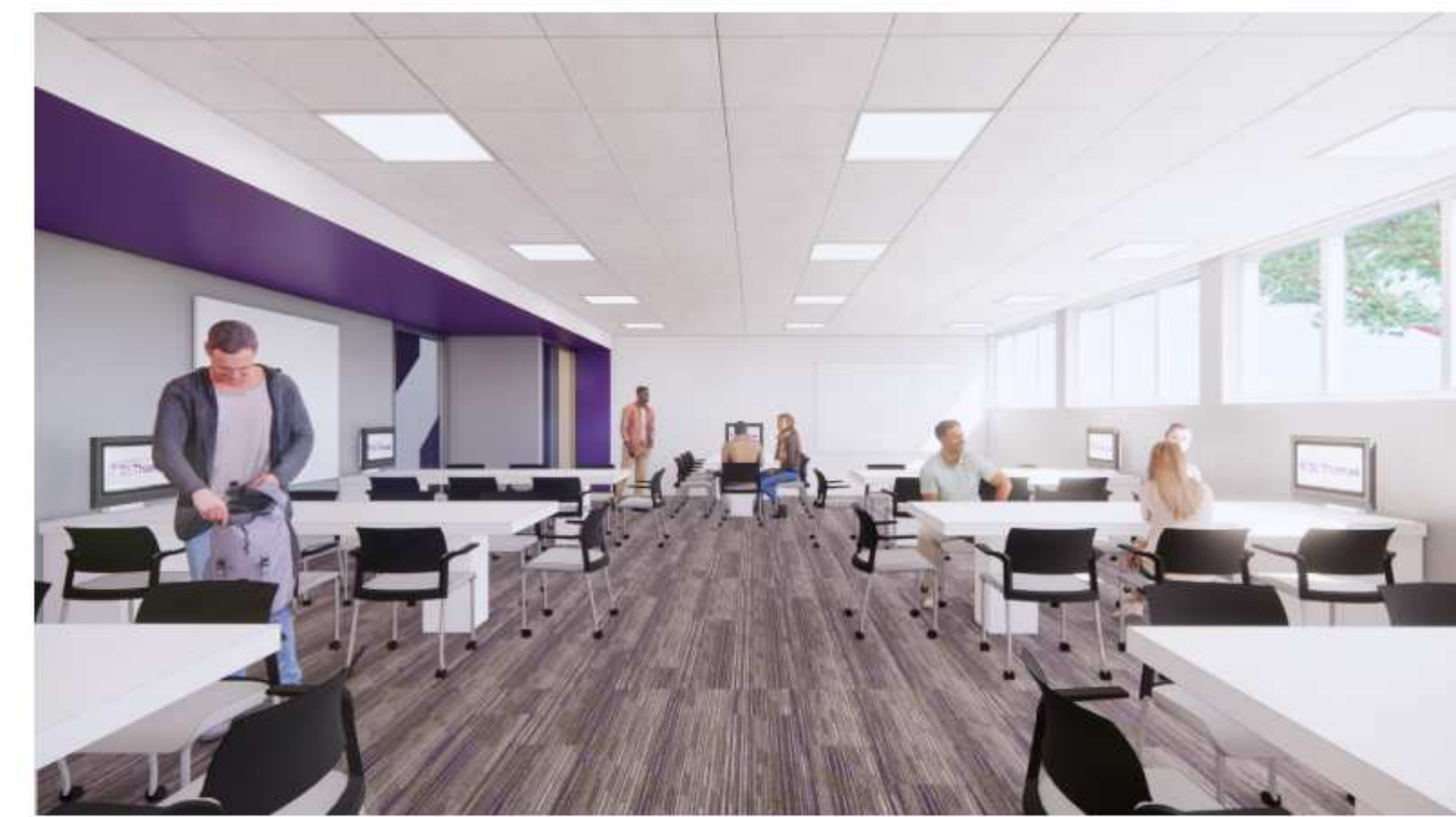
FIRST FLOOR CLASSROOM