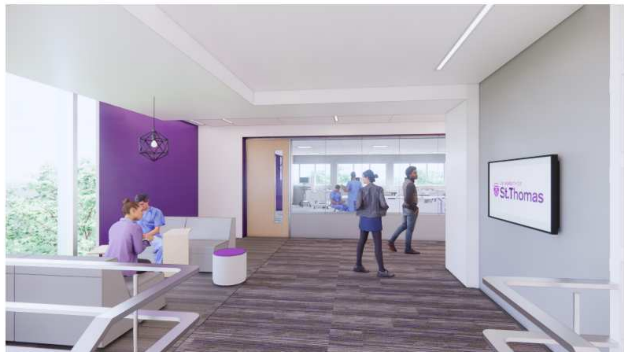
THIRD FLOOR LOBBY STAIR