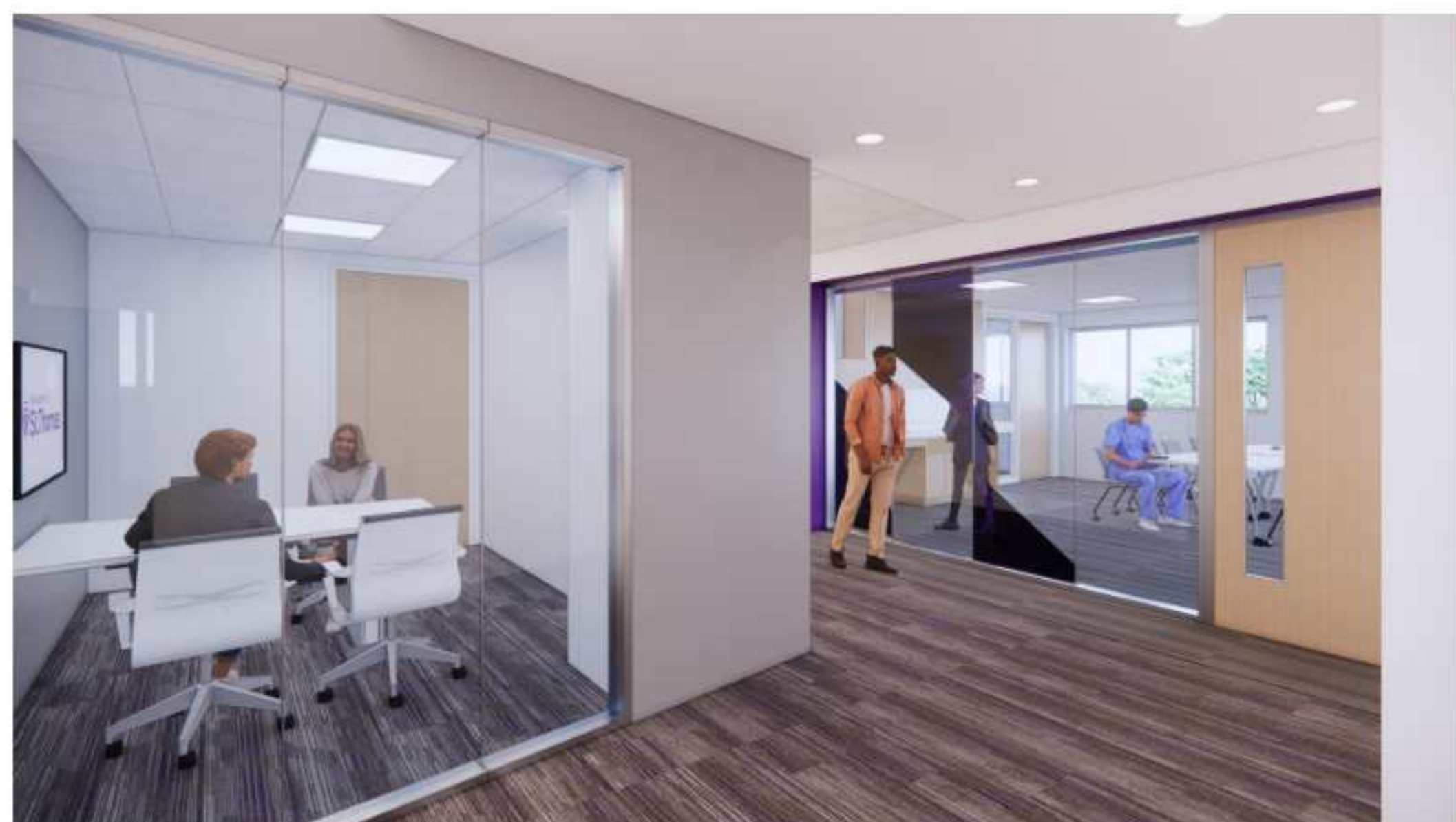
THIRD FLOOR CIRCULATION OUTSIDE STUDENT SPACE/HUDDLE