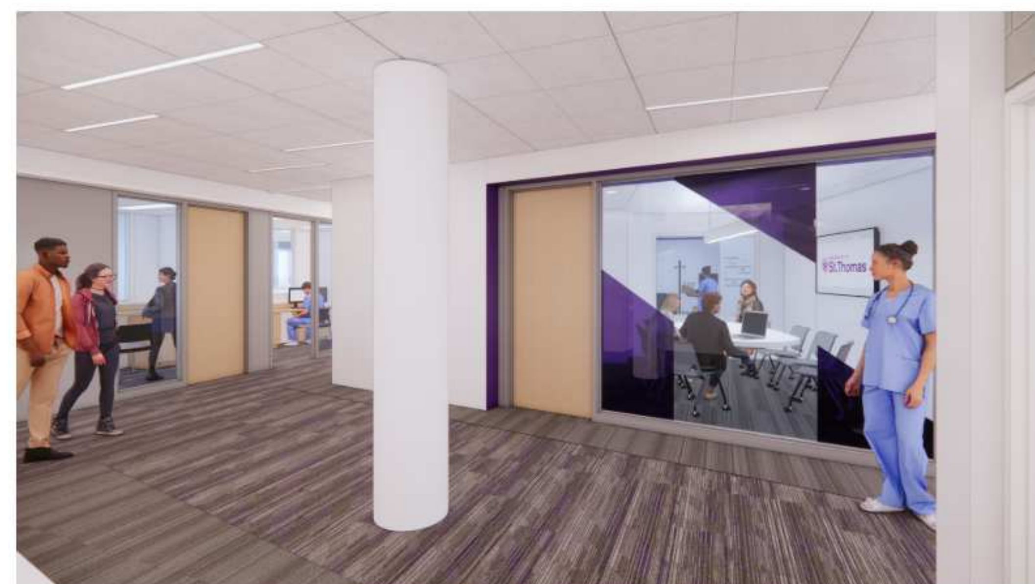
THIRD FLOOR CIRCULATION OUTSIDE SIMULATION