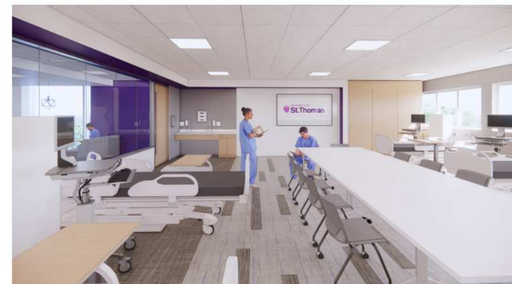
THIRD FLOOR SKILLS LAB