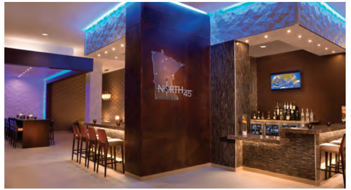
North 45° Restaurant and Bar