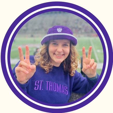
Hannah Samuelson Publications