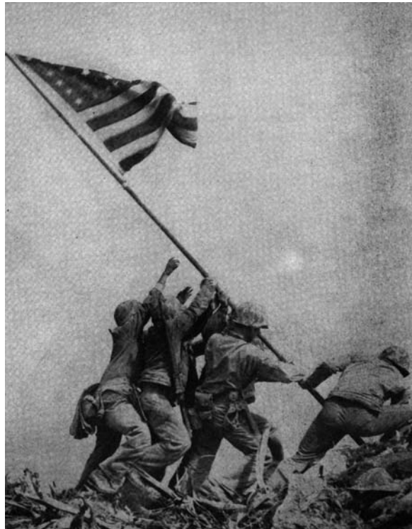
“Raising the Flag on Iwo Jima” by Joe Rosenthal. Hayes is the man on the farthest left.

After the Japanese attack on Pearl Harbor, he felt it his patriotic duty to serve. The Tribe approved, and after a proper sendoff Ira Hayes left for the boot camp.