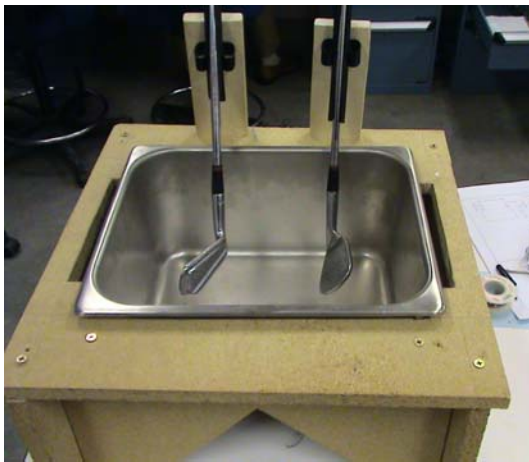
Figure 1 – First prototype

Senior Design Project Summary: This project required a design focused multidisciplinary engineering team in the creation of an automatic golf club cleaning system. Ultrasonics is a technology already being used to clean medical devices, tools, jewelry, etc. Using this proven technology, the product will be the first of its kind to be marketed for personal home use; currently there is no automated home consumer based golf club cleaners. The design of the unit must balance affordability and performance resulting in a product that is effective and easy to use. A detailed development phase was implemented where mechanical and electrical components were chosen in accordance with customer requirements. Electrically, a generator was designed to run at 40 kHz and 70 Watts. This frequency and power are based on the size of the tank and typical golf club composition. Mechanically, the product requires a user friendly, aesthetically pleasing, two club hold design. A seal around the rim of the tank is used to isolate the electronics from the liquid and concentrate ultrasonic vibrations on the tank.