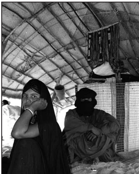
Interior of a Tuareg tent in Timbuktu