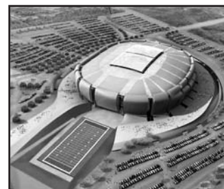
Aerial view of the Arizona Cardinals Stadium. Peter Eisenman , architect.

To register for Dr. Eisenman's lecture, and/or one or both of the symposia, (there is a fee for Eisenman's lecture and the professional symposium) please call (651) 962-5560 or email sefocke@stthomas.edu . For more information, check our website at www.stthomas.edu/arhistory/UndergradSite/events.html .