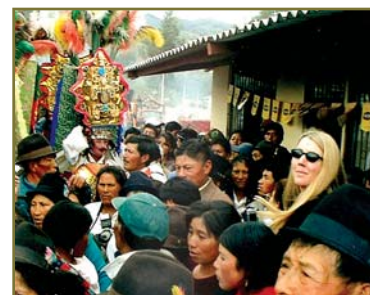
Corpus Christi celebration in Pujili, Ecuador

As many of you already know, I will be leaving St. Thomas in the spring to take a position at the College of William and Mary. This is a bittersweet decision, since it means that I will leave all of the people here who I have come to consider family. It has been a pleasure and a privilege to have worked with each of you over the years – I can’t imagine a more collegial, dedicated, professional, and genuinely fun group of faculty, staff, and students than all of you! I will miss you.