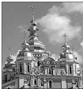
St. Michael's in Kiev