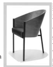
Phillipe Starck, "Cocoon" armchair, 1984